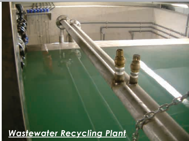
Wastewater Recycling Plant